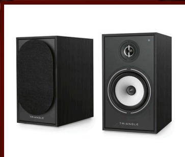
TRIANGLE Pearl of a oridable hi-fi