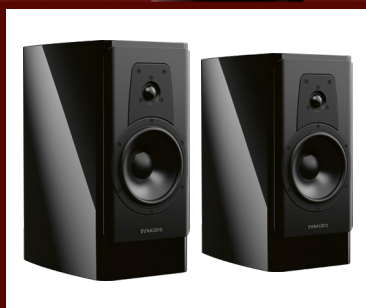
DYNAUDIO Black magic