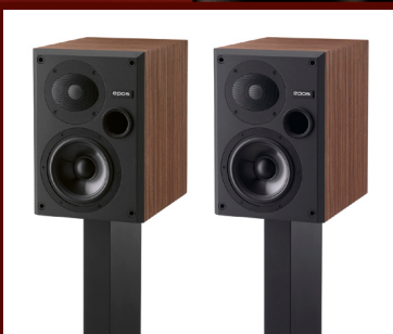
EPOS Expert for the shelf